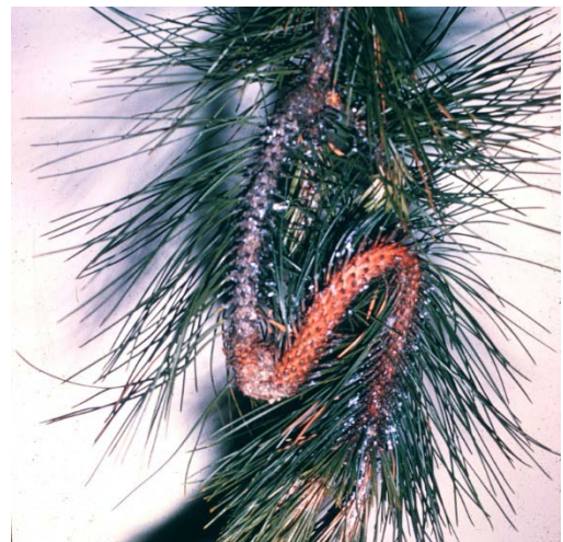
Figure 3: EPSM damage to a Red Pine

The damage caused by EPSM is almost entirely during the larval stage. Their feeding patterns result in the killing of individual needles, killing of buds before winter, as well as the damaging or killing of developing buds and elongating shoots in the spring. The latter can result in adventitious buds, leading to unsightly witches'-broom growths, or irregularly formed shoots (Figure 3).