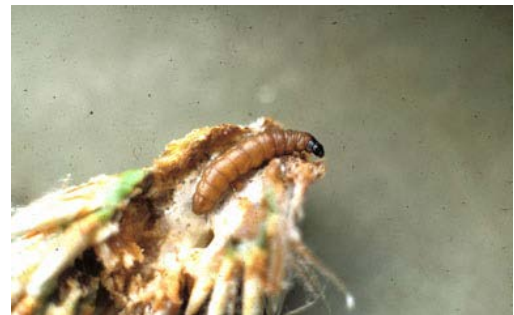
Figure 2: EPSM Larva

Eggs hatch in the early stages of summer, around June-July, from which the larvae will spin webs on the needle sheath of the tree and proceed to bore into the base of the needles and begin feeding. As larvae mature, they will move through the stem and into the buds to continue feeding, this is where they will overwinter. In the spring larvae will seek out an undamaged bud to resume feeding. The larvae will construct a tent of webbing and pupate around early May, with adults emerging later in May or June. Adults immediately begin mating and laying eggs, which hatch in seven-ten days.