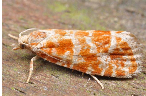
Figure 1: Adult EPSM

Adult EPSM (Figure 1) have a reddish-brown coloration and a wingspan of about \frac{3}{4} of an inch (~18mm). The forewings also feature irregular silver colored bars. These moths bare a strong resemblance to many other species of pest moths, making identification somewhat difficult. The larvae range from pale yellow to brown with a black head. Larvae on average are about \frac{1}{2} inch long (12mm).