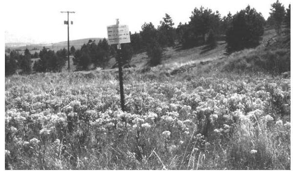
June 2006 – Whitetop before treatment